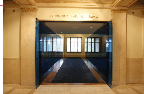
The generosity of Edward L. Gaylord, 1974 Oklahoma Hall of Fame Honoree, and T. Boone Pickens, 2003 Oklahoma Hall of Fame Honoree, made possible the Edward L. Gaylord—T. Boone Pickens Oklahoma Heritage Museum and a state-of-the-art Oklahoma Hall of Fame Gallery.