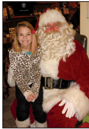
(left) Santa makes guests smile during Downtown in December's Oklahoma City Community Foundation Free Museum Sundays.