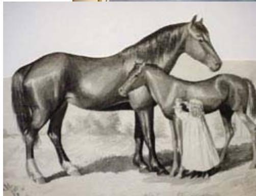
By Augusta Metcalfe