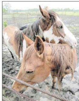
Some of the horses that were seized by Tulsa County deputies wait Thursday in their temporary new home at the Collinsville Livestock Sales stockyard.

ed in public transit. One finding indicated a willingness, especially among suburban residents, to use a "park-and-ride" route to downtown Tulsa. The survey also indicated that Tulsans embrace many reasons given to invest in public transportation, such as providing services for the elderly and disabled, coping with high gas prices, helping people get off welfare, helping to control pollution, and easing road congestion. The survey was conducted by Cole Hargrave Snodgrass & Associates.