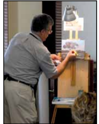
(below) The Oklahoma Society of Impressionists, featured in the Pure Color exhibit, at the reception in their honor.